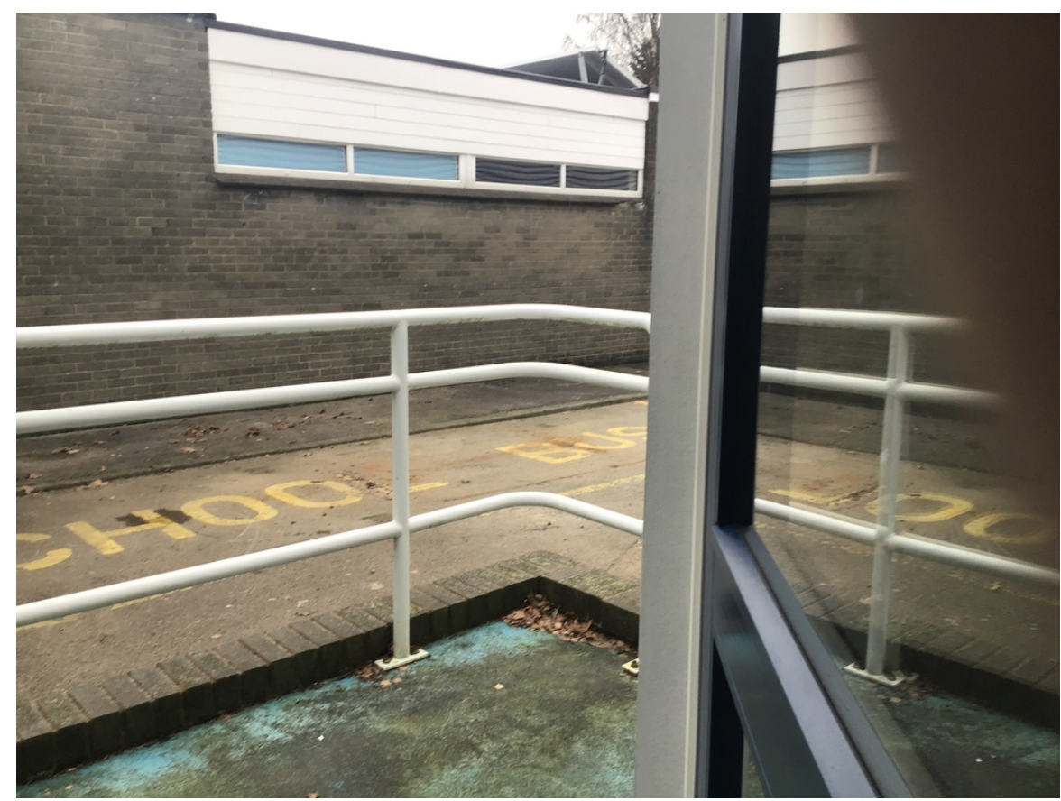
When you have finished you will go out of this door.