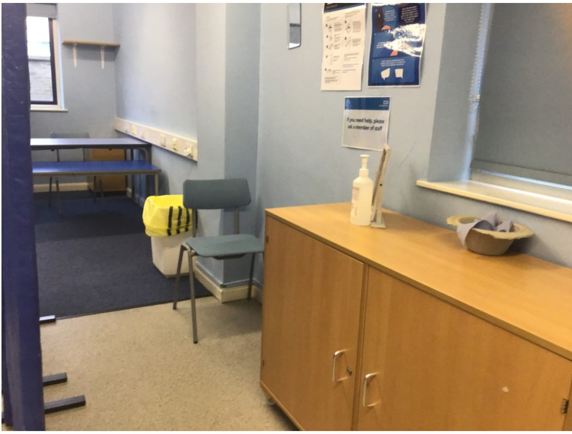
This is where you will have your test.